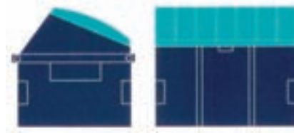
3 cubic metre