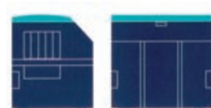
6 cubic metre